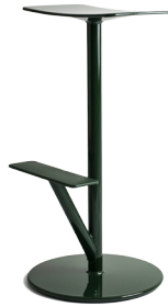
Glossy colour Dark Green