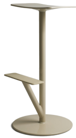
Glossy colour White