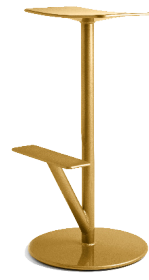
Glossy colour Ocher