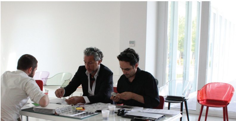
Designer in Magis

of Cyborg, a seat with a highly resistant and versatile polycarbonate shell. The seat can then be completed with backrests in a selection of different natural or synthetic materials: from polycarbonate to wicker, from solid wood to plywood, to the most recent upholstered versions with fabric or leather cover. This further evolution of the chair is in equal parts poetic and technological, cosy and surprising, in keeping with the widest range of different settings.