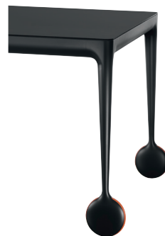
Frame: Black 8510 Top: Black 8510