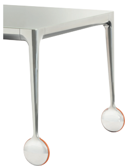
Frame: Polished Aluminium Top: White