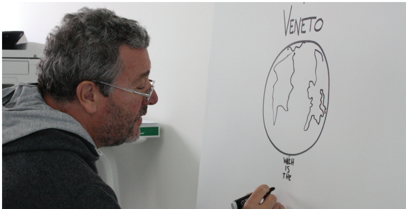
Designer in Magis

maximum overall length of three metres. The table can be extended effortlessly, without needing to lift it, simply by gliding the extending end on the floor thanks to the two wheels, and to a patented sliding and locking mechanism developed especially for Big Will. Thus, this is an elegant, high-profile table, the fruit of several years of research to achieve that “more than” that Magis always seeks, as its very name reveals.