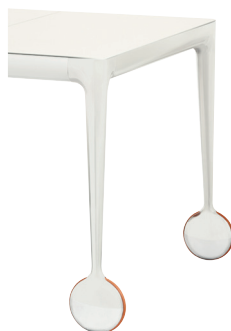
Frame: White 8500 Top: White 8500