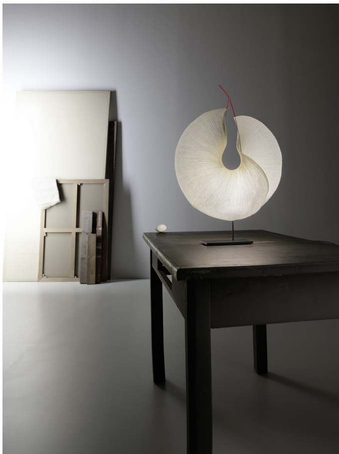
Yoruba Rose DAGMAR MOMBACH, INGO MAURER & TEAM 2017

Paper, metal, stainless steel, silicone. Yoruba Rose is a light object that enchants through perfection and grace. The sheet of paper is almost circularly stretched on light metal wires and strives upwards. The harmonious expression of the model and the extremely pleasant light make it the ideal light source in spaces where one rests. Yoruba Rose can also be produced as a standard lamp on request. Just as in all other MaMo Nouchies, the lampshade consists of Japanese paper, which has to undergo a special manufacturing process in Dagmar Mombach's studio. The light source is an LED module, provided with a cooling element, developed by Ingo Maurer especially for the MaMa Nouchies. The light is warm and soft, and can hardly be distinguished from conventional halogen light. Yoruba Rose is usually available for immediate delivery.