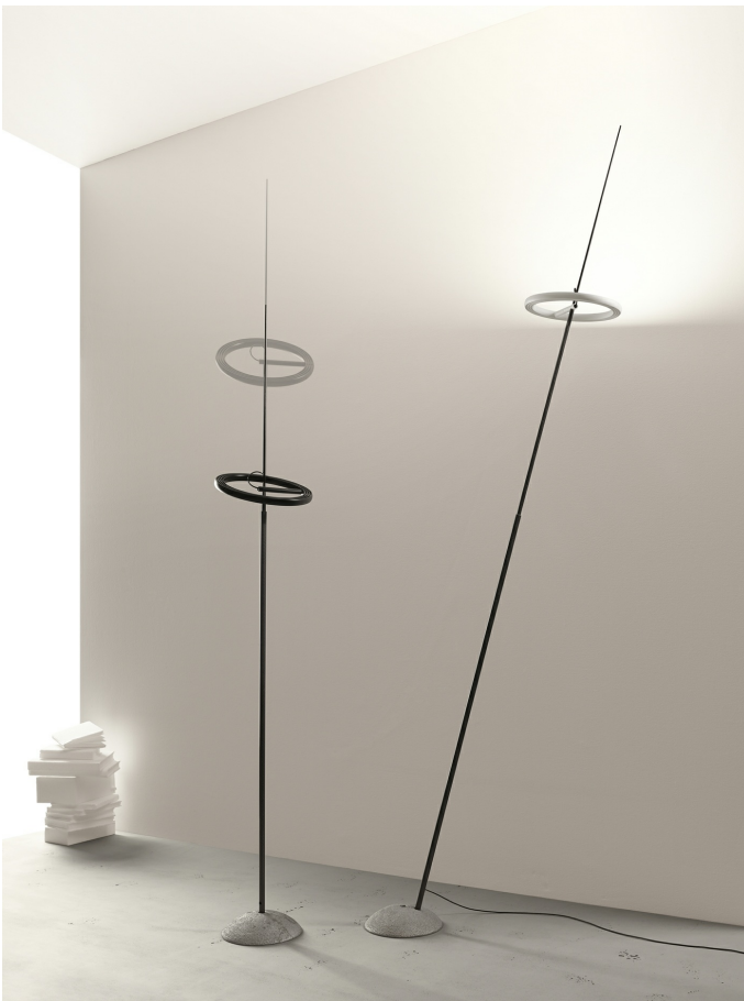
Ringelpiez INGO MAURER UND TEAM 2016

The aluminium ring with integrated dimmable LEDs can be fixed as up- or downlight. Without tools, you can adjust the angle of the ring, the rod or even change the orientation of the LEDs. The rod in carbon fiber can be fixed vertically or at an angle of 15° in the base. There is no visual noise around the slender pointed rod, the cable is inside. Even so, the rod is extendable from 150 to 210 cm. Transformer with slide control. Dimmable. The ring with LEDs is only available in black.