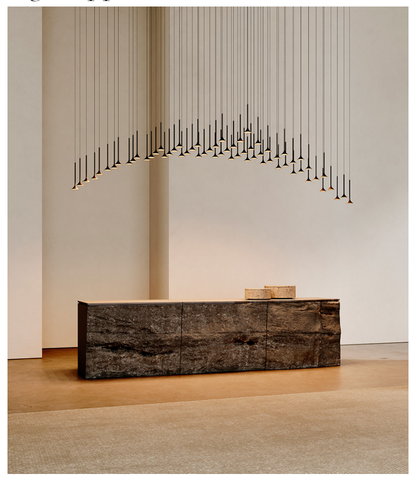
Image may not match reference. LedsC4 reserves the right to amend any of the product's components. The data related to flux, power and colour temperature may be subject to changes made by the manufacturer.