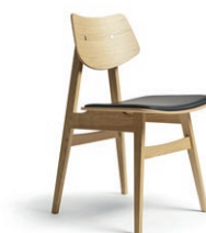
Seat and back offset upholstery