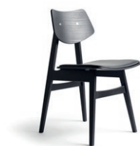
Seat offset upholstery