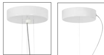
LARGE VERSION SMALL VERSION