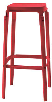
Seat + Foot-rest: Red 5083 Legs: Beech painted Red