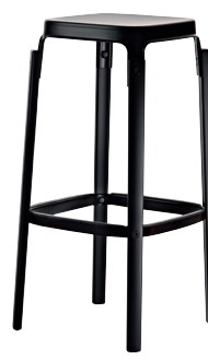
Seat + Foot-rest: Black 5140 Legs: Beech painted Black