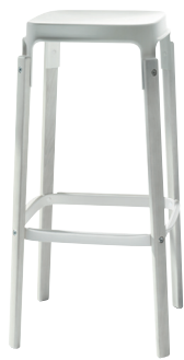
Seat + Foot-rest: White 5108 Legs: Beech painted White