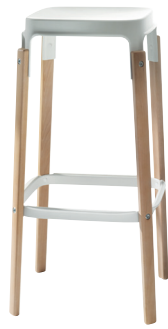
Seat + Foot-rest: White 5108 Legs: Natural Beech