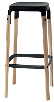
Seat + Foot-rest: Black 5140 Legs: Natural Beech