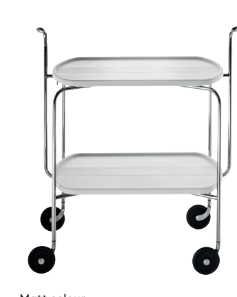
Matt colour Shelves: White 1690 C