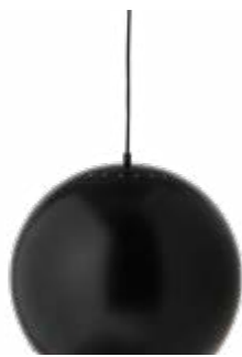
Matt black: art.no. 100532 Black fabric cord