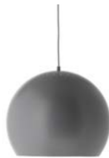
Matt grey: art.no. 100536 Grey fabric cord