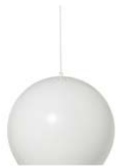
Matt white: art.no. 100534 White fabric cord