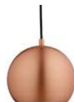
Matt brushed copper. Art.no. 100182 Black fabric cord