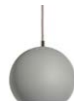
Matt light grey. Art.no. 100208 Grey fabric cord