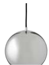
Glossy chrome. Art.no. 100188 Black fabric cord