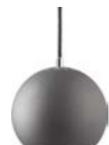
Matt dark grey. Art.no. 100205 Black fabric cord