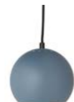
Matt dust blue structure. Art.no. 100212 Black fabric cord