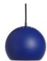
Matt cobalt blue. Art.no. 100207 Black fabric cord