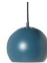
Matt petrol blue. Art.no. 100202 Black fabric cord