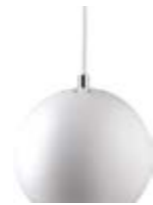
Matt white. Art.no. 100201 White fabric cord