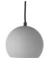
Light grey structure. Art.no. 100214 Black fabric cord