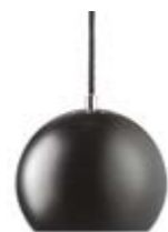
Matt black. Art.no. 100199 Black fabric cord