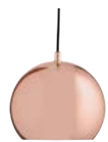
Glossy copper. Art.no. 100175 Black fabric cord