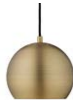
Matt antique brass. Art.no. 100167 Black fabric cord