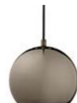
Glossy black chrome. Art.no. 100195 Black fabric cord