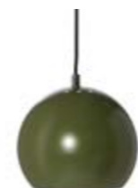
Matt Dark green. Art.no. 100204 Black fabric cord