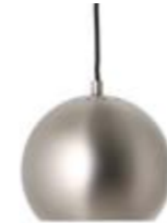
Brushed Satin. Art.no. 100186 Black fabric cord