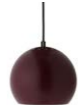
Matt dark bordeaux. Art.no. 100209 Black fabric cord