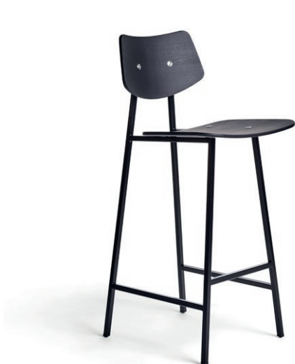
1960 Barchair Low (seat height 65cm)