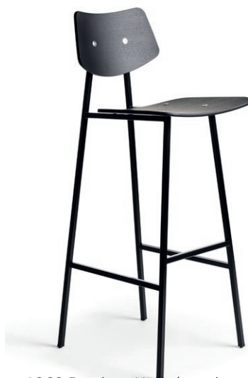
1960 Barchair High (seat height 75cm)