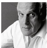
› Richard Sapper