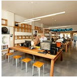
› Oxigen Landscape Architects