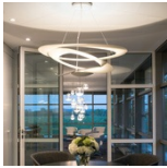
› Office WHW Hillebrand