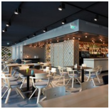
› Design Offices