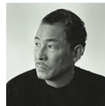
› Issey Miyake