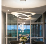
› Office WHW Hillebrand