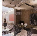
› LARTE Restaurant